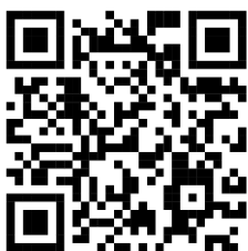
Download Zoom Workplace Application

In case you have any problem, please contact our Program staff at mscm.commarts@chula.ac.th