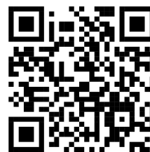
Download Line Application